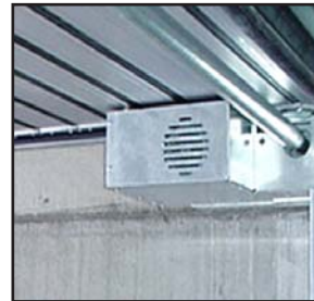
Compact Motor Compact, variable speed motor with soft acceleration and braking for smooth starts and stops. Shown with optional motor cover.