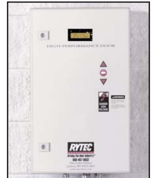
System 3 Controller Makes programming and troubleshooting easier, more flexible and more precise than ever.

Travel Speed: Opens at up to 60 inches per second.